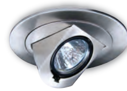
CTR1624-NK Nickel Fully Adjustable Square in Round

A 75W Lamp may be used in LVR1675 housings. To convert trims, order the 1624 SOCKET-75W Socket Replacement.