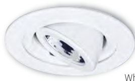
CTR1606-P White Surface Adjustable

A 75W Lamp may be used in LVR1675 housings. To convert trims, order the 1624 SOCKET-75W Socket Replacement.