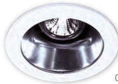
CTR1602-P-CLR Adjustable Multiplier: Clear Reflector, White Trim

A 75W Lamp may be used in LVR1675 housings. To convert trims, order the 1624 SOCKET-75W Socket Replacement.