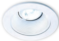
CTR1601-P-WHT Adjustable White Baffle White Trim