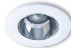
CTR1614-P-CLR White Angled Wall Wash