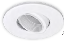
CTR1607-P-WHT Adjustable White Pin Spot White Baffle & Trim

CTR1607 Series Adjustable Pin Spot 2" I.D., 4-3/4" O.D.