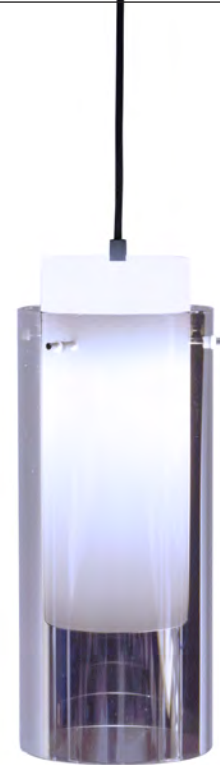
CTG61S-OFG101 ELEMENTS Silver/Chrome Double Cylinder configuration for CRS8 LED Pendant